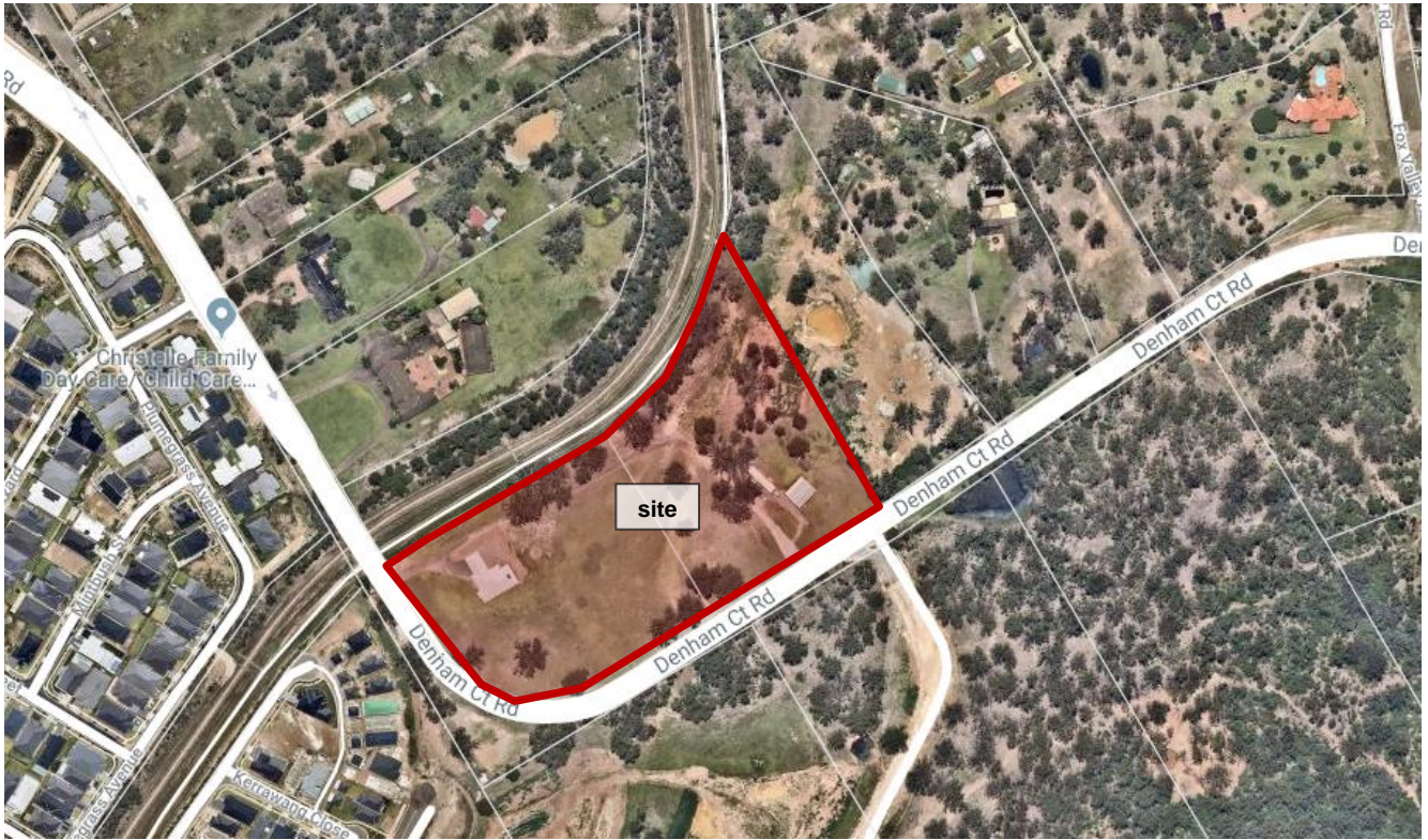
Figure 1: Site Map